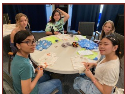
Arts and crafts table at Peace Camp 2023

Peace Camp 2023 , held July 10-14, will be remembered as the first one where the primary planning team and leadership voices were those of the twelve 16-year-old peer counselors who had been invited to help shape the week of evening programming. They were students/former students of local elementary and middle schools where they had been well trained as peer Circle Leaders. Their skills and self-confidence as they facilitated the peer groups were poignant examples of what our younger generation is capable of accomplishing. They are already talking about next summer and have called a meeting to begin the planning!