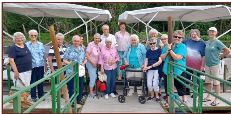
Blue Heron Eco Cruise Participants