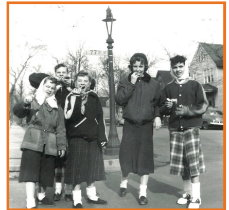
Enjoying a treat at the corner of 77th Street

Transportation: Chicago Surface Lines, Illinois Central Suburban