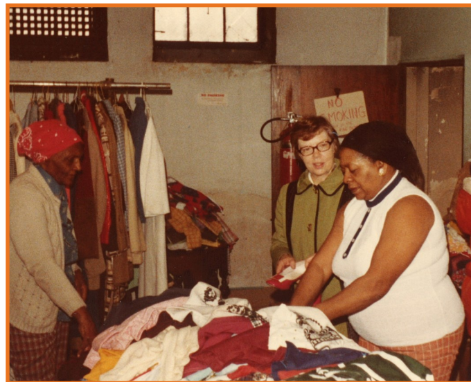
St. Francis de Paula Clothing Center

She retired from AIDS ministry in December 2002, and volunteered at Catholic Charities of Joliet in the Foster Grandparents program until 2006. She then came to live at The Canticle in Clinton, where she actively ministered in any way she could. She moved