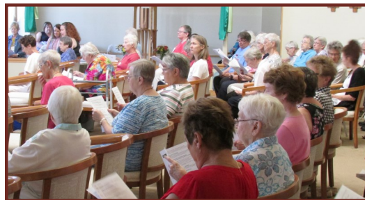
2019 Summer Gathering

The celebration of Jubilee for 2020, 2021, and 2022 Jubilarians will conclude the summer gathering.